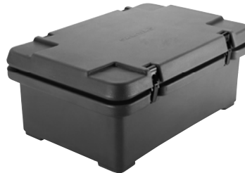
For Camcarrier (160MPC)