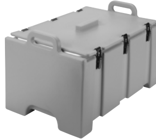
For Camcarrier (100MPC)